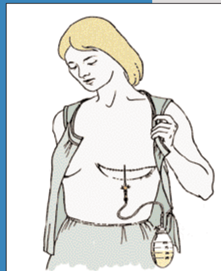
ORIGINAL (1002) SeromaCath® for treating a variety of postoperative seromas.

Authorized Representative in EU: EMDAR BV IJsselburcht 3 Postbus 5486 6802 EI Arnhem The Netherlands